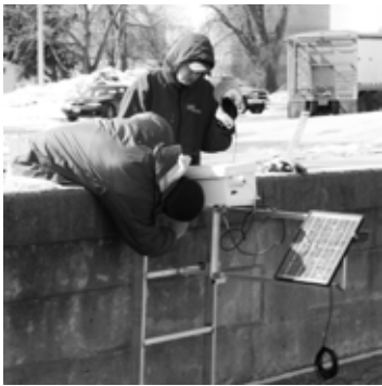
UCAP site install in Waterville, Spring 2009.

The goal of this project is to continue assessment of lakes and stream reaches in the Cannon River Watershed that need be assessed for impairments. This project collects water quality samples from 33 stream reaches and three lakes utilizing citizen stream volunteers and CRWP staff. A total of 430 water samples were collected with 2,430 corresponding water quality measurements recorded. Data collected from this project will be used by the MPCA as they develop the Impaired Waters 303(d) list. We anticipate a majority of the lakes and streams tested will be added to the list for excess nutrient and bacteria concentrations. In early January 2010, CRWP was notified that we will receive a third surface water assessment grant for 2010-2011 to continue surface water assessments in our watershed. I would like to thank all of our volunteers for their participation, we could not do this without you.