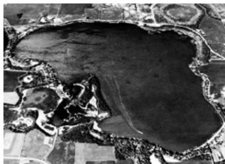
Aerial photo of Lake German

Map shows the City of Dakota (Winona County) and locations for a new sewer treatment site; site constraints include the Mississippi River, Amtrak rail line, Interstate 90 with on and off ramps, and the scenic bluffs.